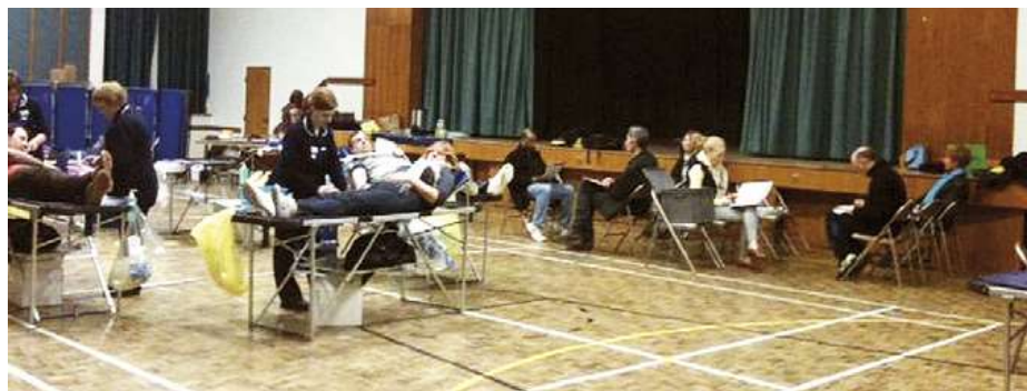
NHSBT receiving donations at an LDS meetinghouse

As the Church moves forward with the strong relationship it has built with the NHSBT, many more lives will be saved and improved because of the blood collected in our meetinghouses. Furthermore, community relationships will be enhanced as tens of thousands