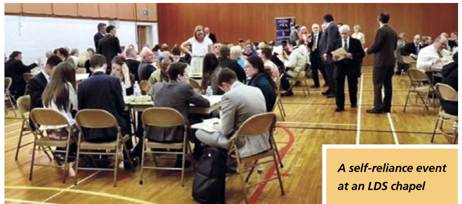
A self-reliance event at an LDS chapel

Another important addition are the introduction of 12 principles of self-reliance, incorporated into the booklet My Foundation: Principles, Skills, Habits . These lessons form part of the weekly group lessons and represent the aspects of spiritual self-reliance enabling us to come closer unto Christ. This booklet may also be accessed in other ways—individually, in family home evenings or in quorum and Relief Society training.